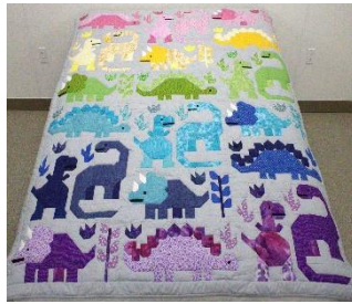
Dinosaurs 67 x 82