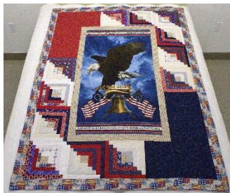
Home of the Brave 52 x 70