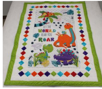
Let the World Hear You Roar 40 x 58