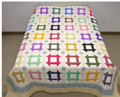
Churn Dash 90 x 103