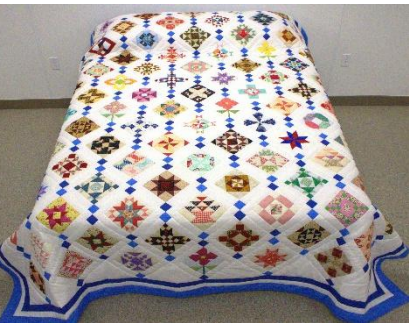
Chandelier 96 x 108