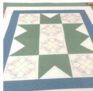
Pastel Pansies Embroidered 96 x 113