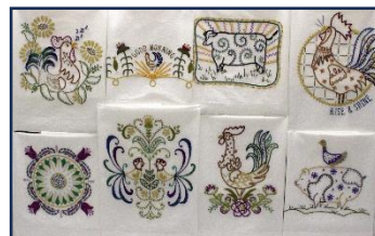
Folksy Farm Towels, Set of 8