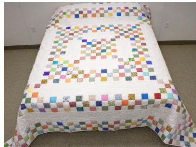
Pastels 105 x 106