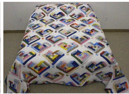
A Mother's Love 104 x 104