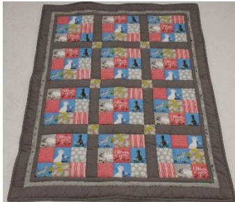
Feline Flannel 34 x 42