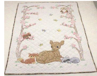
Deer and Friends Embroidered 35 x 53