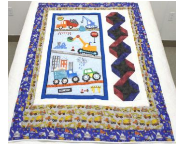
Construction Time 48 x 63