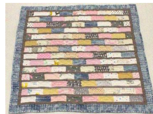
Brick Baby 32 x 32