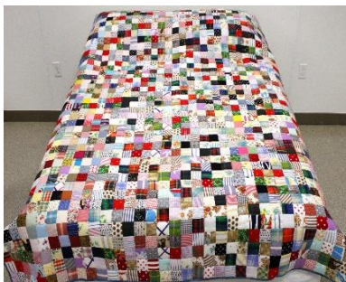
Grandma's Patchwork 76 x 88