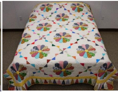
Vintage Dresden Dishes 90 x 104