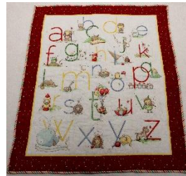
ABCs 34 x 40