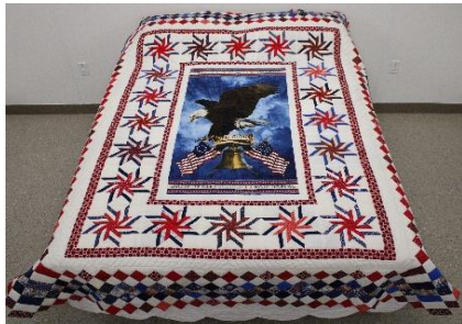
Land of the Free 79 x 96