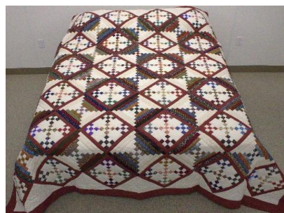
Nine Patch with Courthouse Steps 98 x 99