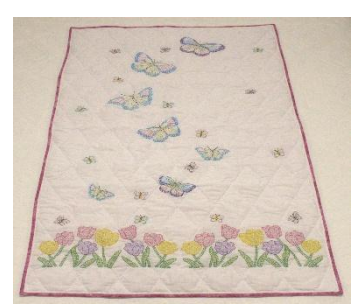
Blossoms and Butterflies Embroidered 32 x 50