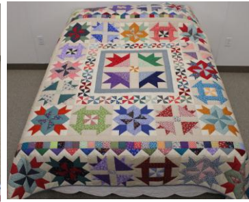
On the Prairie 93 x 95