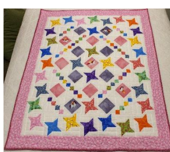
Rollicking Stars Pink 44 x 54