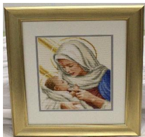
Blessed Mother with Child Counted Cross Stitch 11 x 14