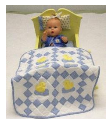
Doll Cradle, Doll and Gingham Ensemble

Matching Funds from Catholic Financial Life and Western Catholic Union – Thank you for your support!!