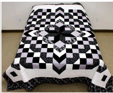
Faceted Star 100 x 101