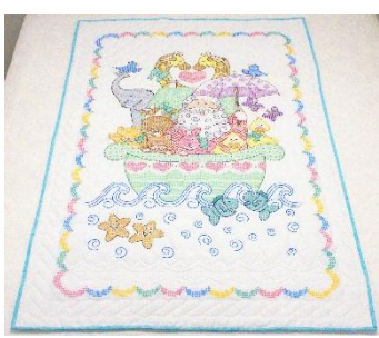
Noah's Ark Embroidered 38 x 58