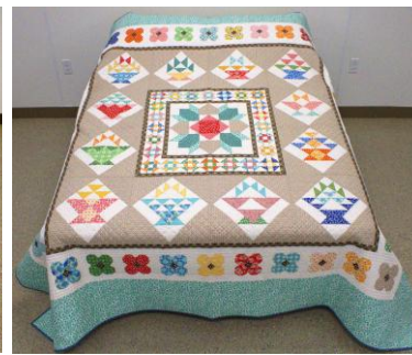
Flea Market 94 x 95