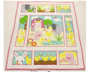
Wee Ones 36 x 43