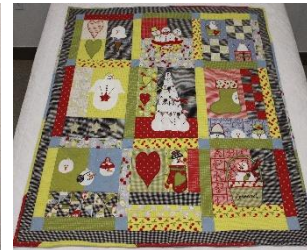
Snowman Fun 48 x 51