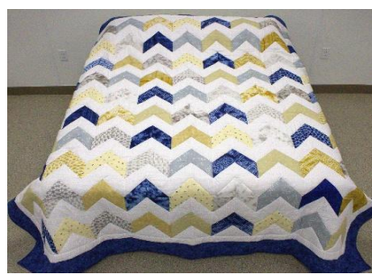
Chevron 88 x 97