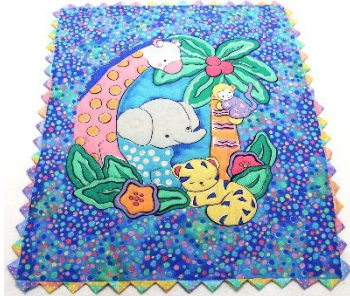
Jungle Animals with Prairie Points 36 x 45