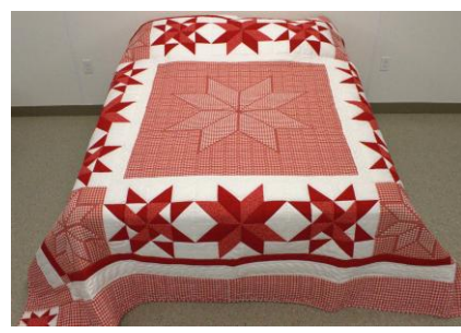
Vintage Chicken Scratch 104 x 116