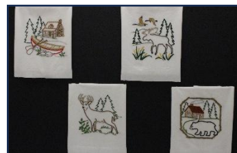
Northwoods Lodge Wildlife Towels, Set of 4