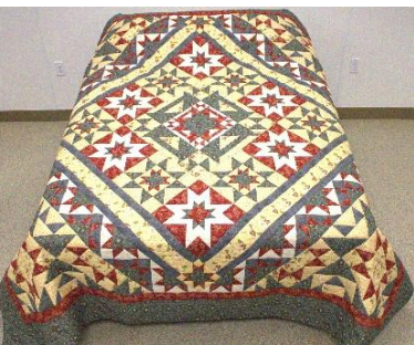
Gloriarta 97 x 98