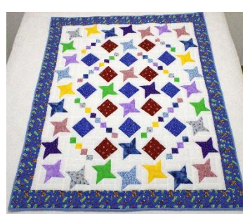
Rollicking Stars Blue 43 x 54