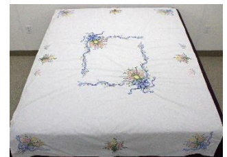
Hand Embroidered Tablecloth 59 x 89