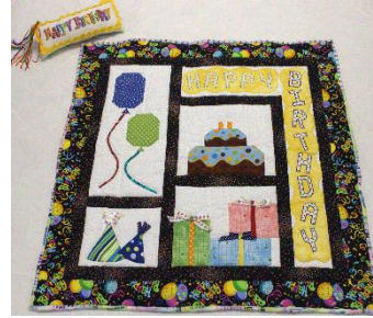
Happy Birthday with Pillow 35 x 35