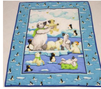
Baby Penguins 34 x 42