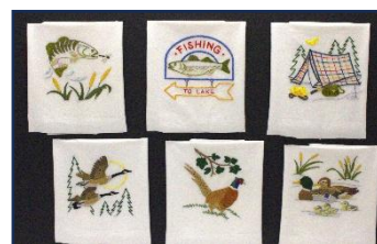
Northwoods Lodge Fish & Fowl Towels, Set of 6