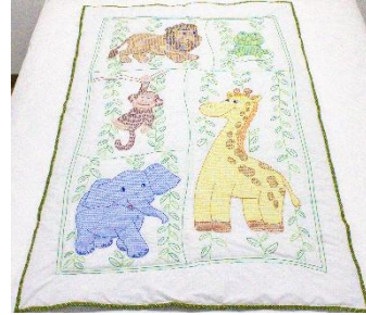
Jungle Fun Embroidered 38 x 58